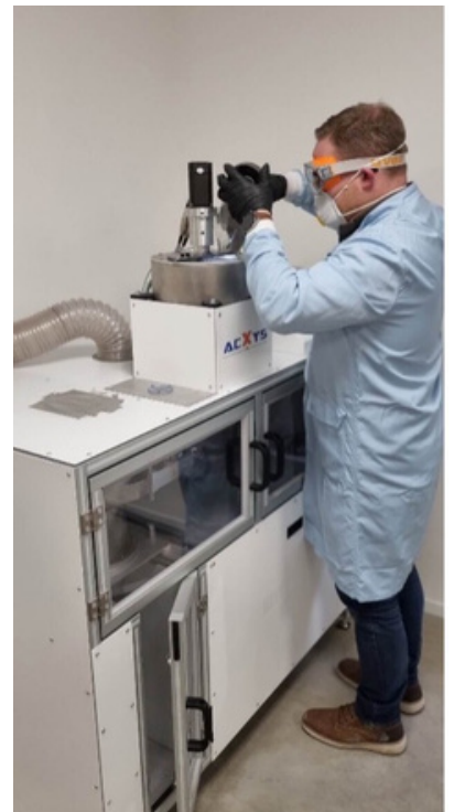
Aluminium powder processing

Creating advanced and high-performance materials for Additive Manufacturing to support industry 4.0 expansion and decrease its carbon footprint, Luxembourg based AM 4 AM have patented a cold plasma process using AcXys Technologies TKS equipment , that provides extra properties to conventional materials thereby extending the range of AM (Additive Manufacturing) materials used mainly in the 3D printing sector.